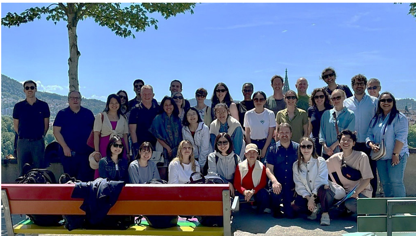
IAIS Secretariat, May 2026