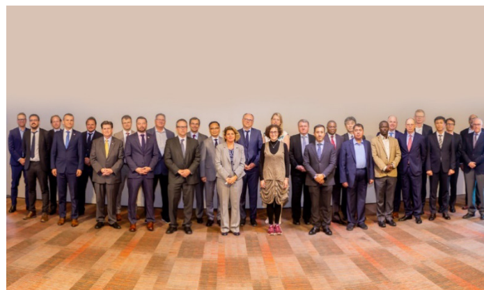
IAIS Executive Committee at 2022 Annual Conference in Santiago de Chile