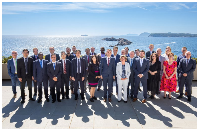
IAIS Executive Committee members gathered in Dubrovnik for the IAIS committee meetings and Global Seminar, June 2022.