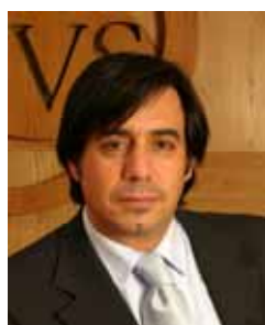
Guillermo Larrain Ríos Chile Superintendencia de Valores y Seguros