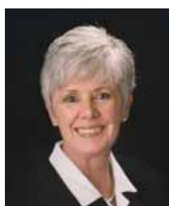
Sandy Praeger Kansas/USA