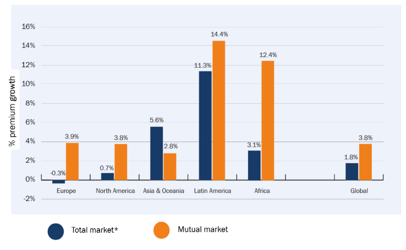
*Total market as per Swiss Re

Regional market and mutual compound annual growth rates (2007-2014)